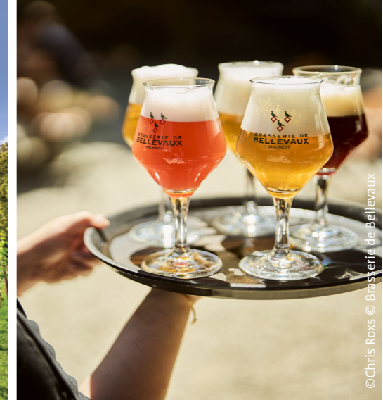
© Chris Roxs © Brasserie de Bellevaux